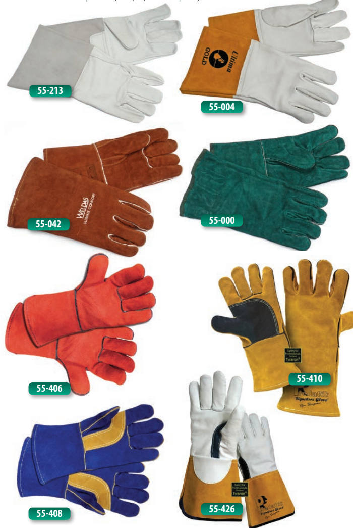
Gauntlets & Gloves (All prices in £ sterling ex.VAT) (Prices per pair)