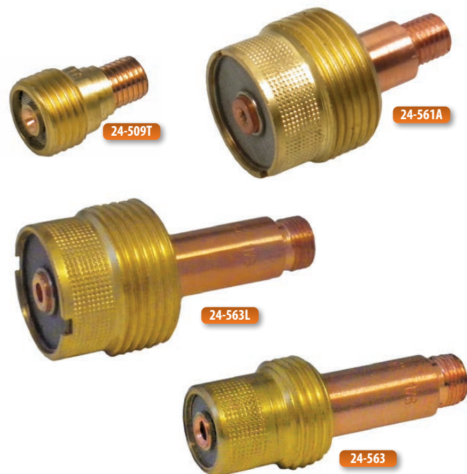
TIG Torch Parts (All prices in £ sterling ex.VAT)