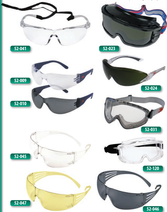
Safety (All prices in £ sterling ex.VAT)