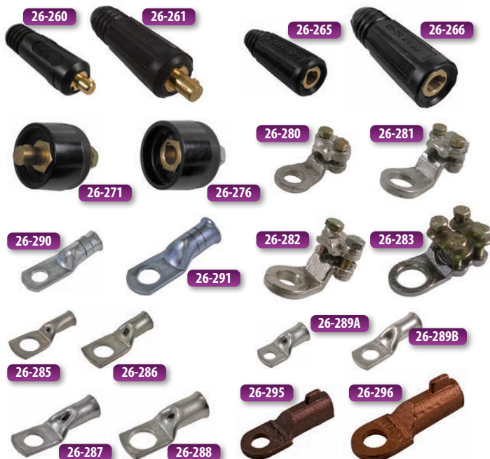
MMA Parts (All prices in £ sterling ex.VAT)