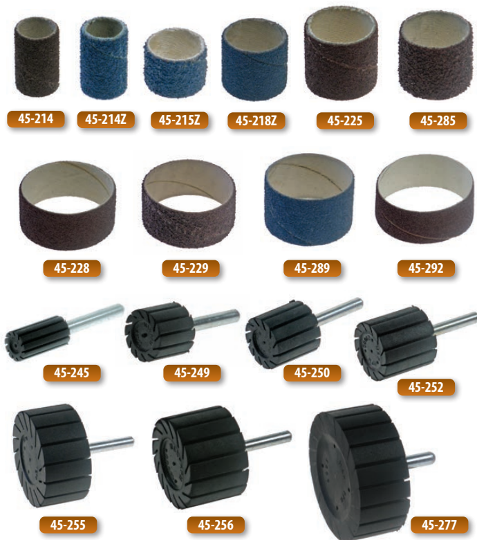
Abrasives (All prices in £ sterling ex.VAT)