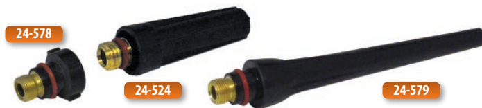
TIG Torch Parts (All prices in £ sterling ex.VAT)