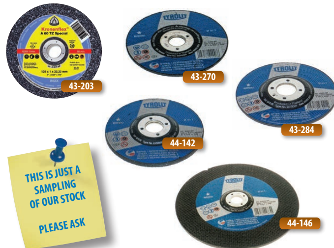
Abrasives (All prices in £ sterling ex.VAT)