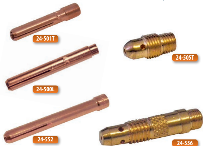
TIG Torch Parts (All prices in £ sterling ex.VAT)