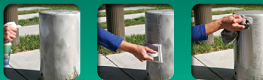
Galv Spray, WD40 &amp; St/St Cleaners (All prices in £ sterling ex.VAT)