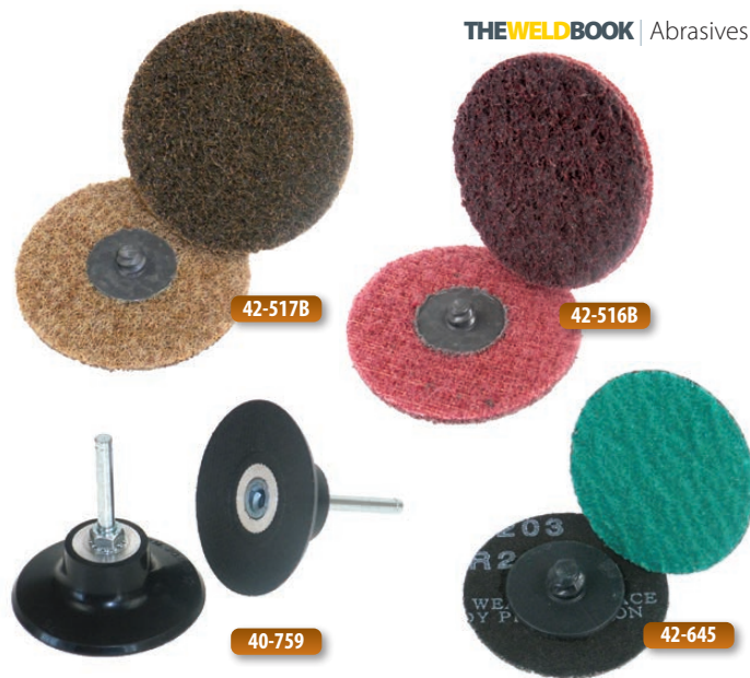
Abrasives (All prices in £ sterling ex.VAT)