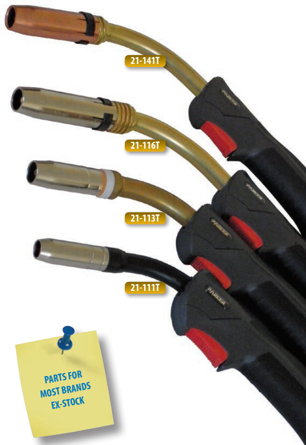
MIG Torches (All prices in £ sterling ex.VAT)