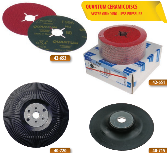
Abrasives (All prices in £ sterling ex.VAT)