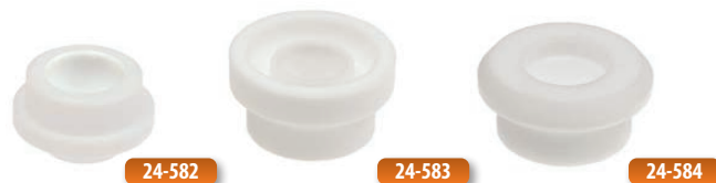
TIG Torch Parts (All prices in £ sterling ex.VAT)