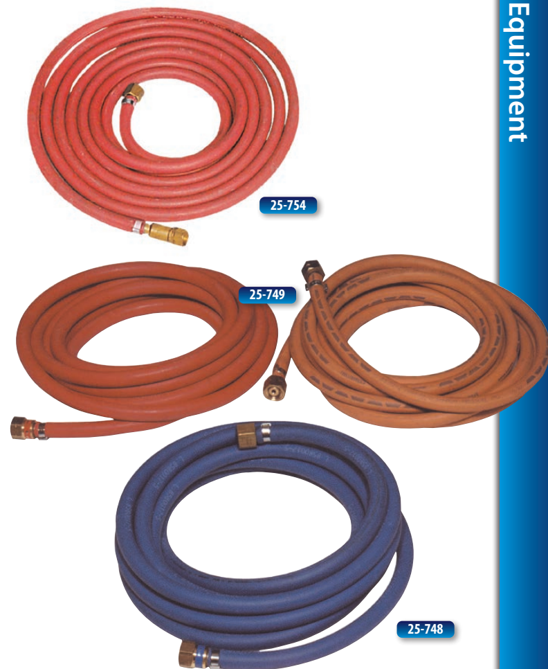
Gas Equipment (All prices in £ sterling ex.VAT)