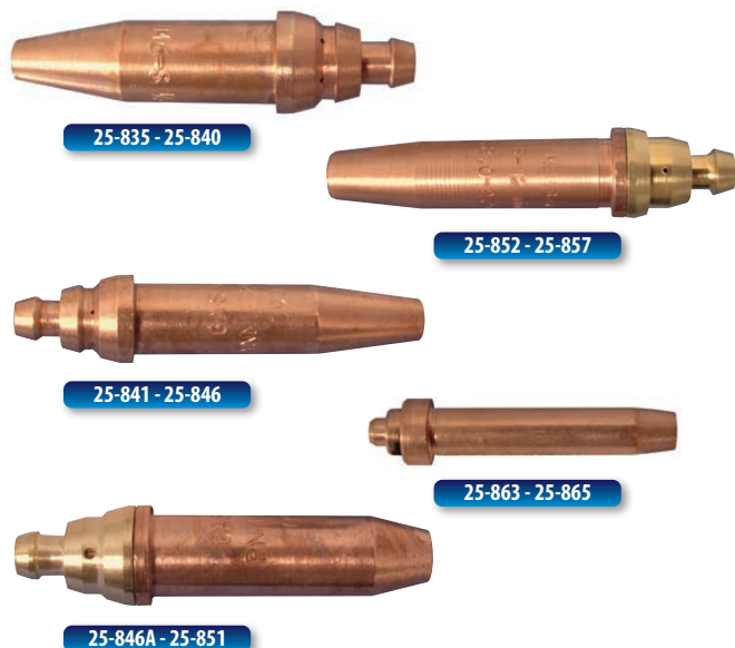
Gas Equipment (All prices in £ sterling ex.VAT)