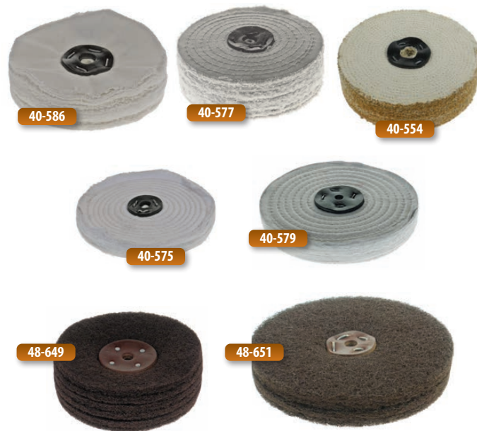
Polishing Mops (All prices in £ sterling ex.VAT)