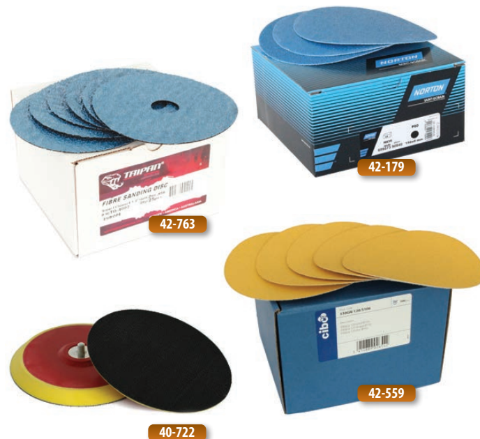
Abrasives (All prices in £ sterling ex.VAT)