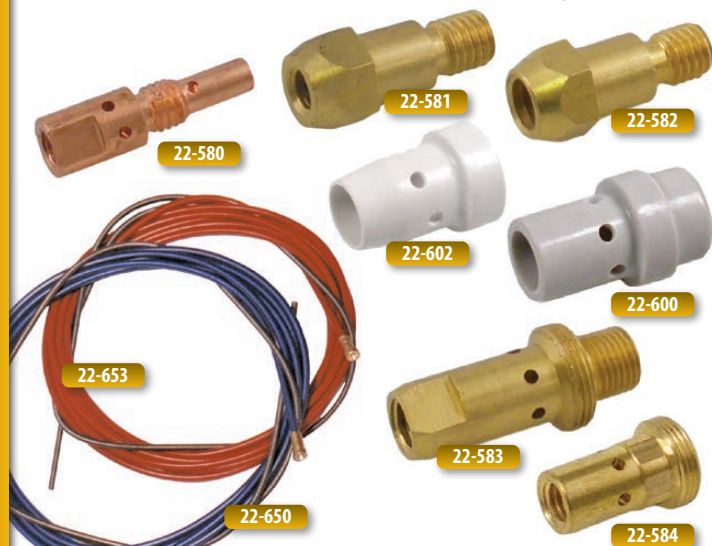
MIG Torch Parts (All prices in £ sterling ex.VAT)