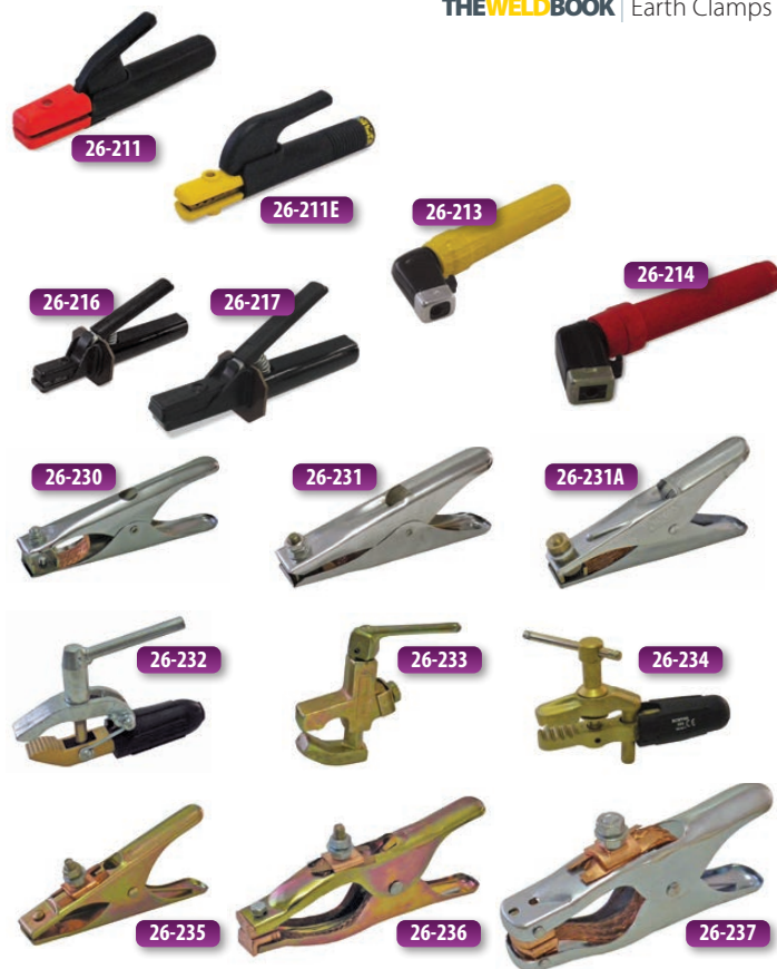
MMA Parts (All prices in £ sterling ex.VAT)