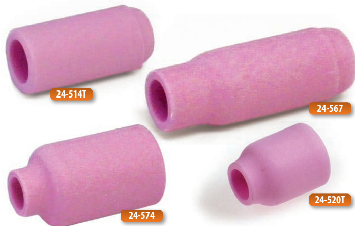
TIG Torch Parts (All prices in £ sterling ex.VAT)