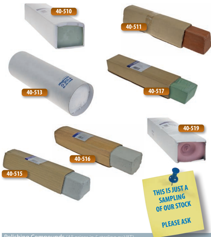
Polishing Compounds (All prices in £ sterling ex.VAT)