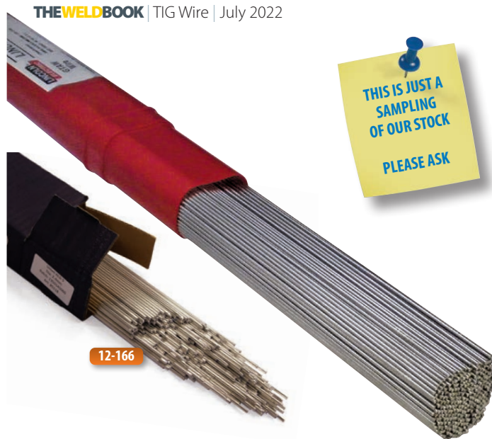
TIG Wire (All prices in £ sterling ex.VAT)