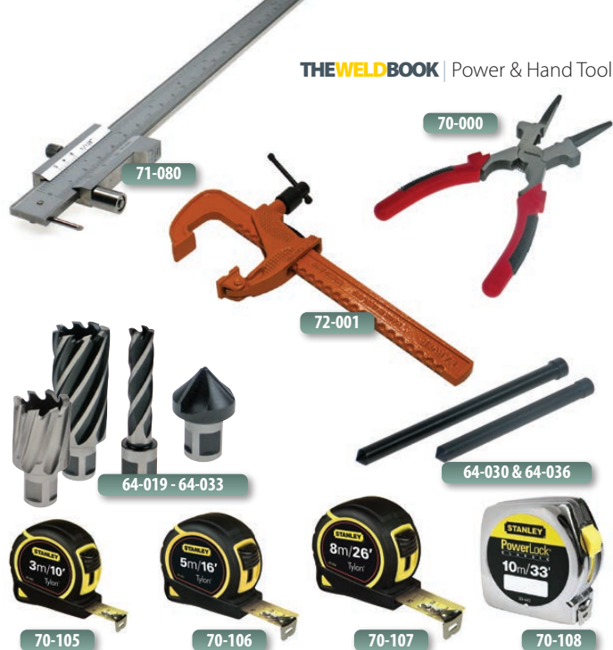
Power &amp; Hand Tools (All prices in £ sterling ex.VAT)