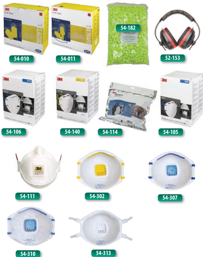
Respiratory Masks & Ear Plugs (All prices in £ sterling ex.VAT)