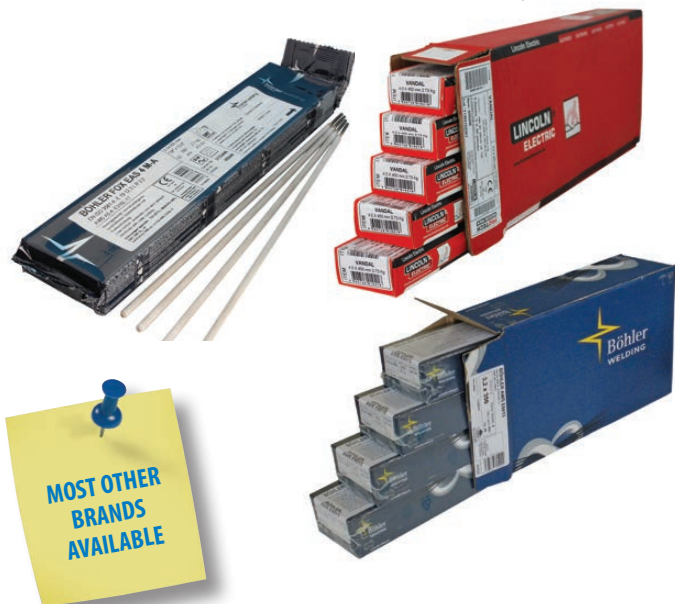
MMA Electrodes (All prices in £ sterling ex.VAT)