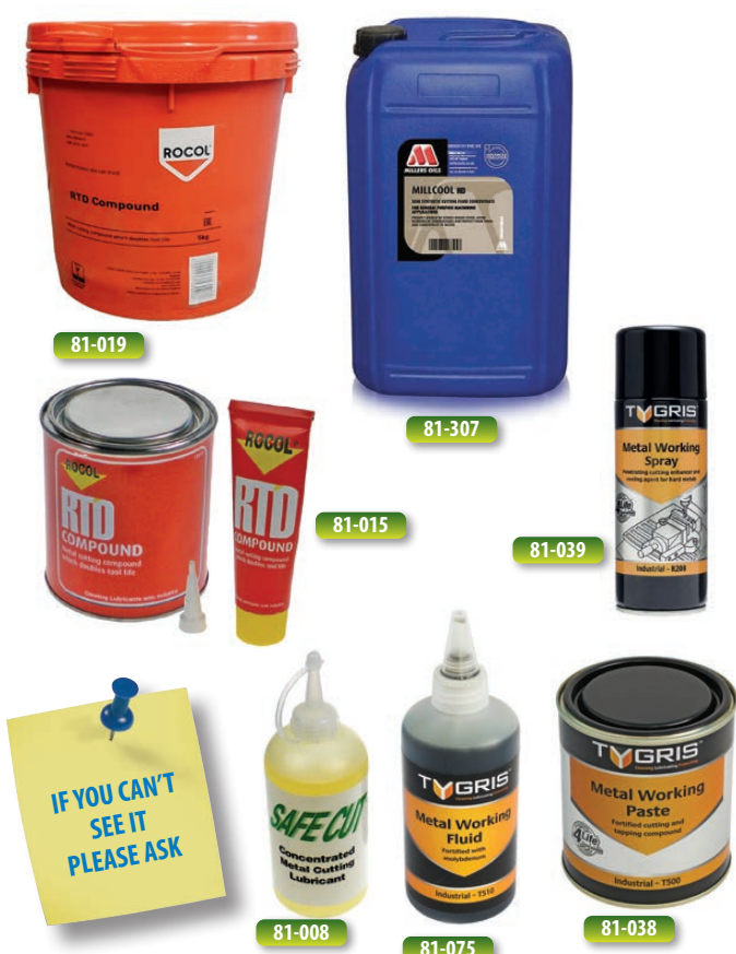
Lubricants & Cutting Oils (All prices in £ sterling ex.VAT)