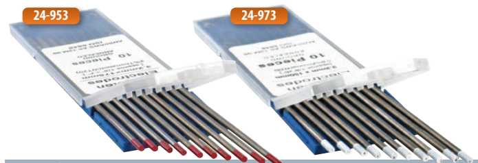
TIG Torch Parts (All prices in £ sterling ex.VAT)