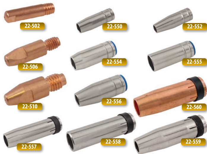
MIG Torch Parts (All prices in £ sterling ex.VAT)