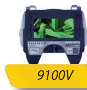
Speedglas 9100 Viewing Area Comparison