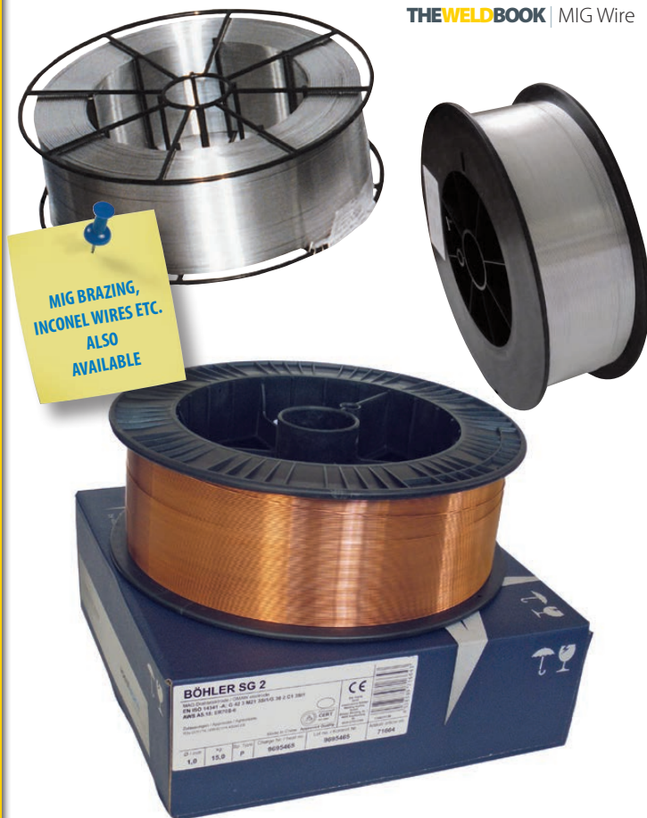
MIG Wire (All prices in £ sterling ex.VAT)