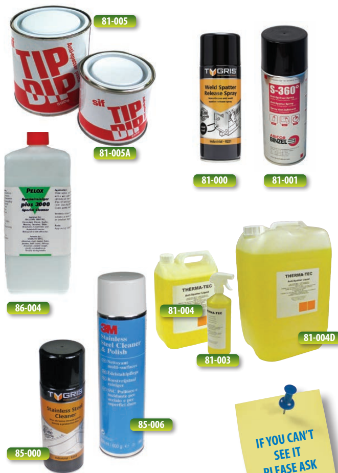
Anti-Spatter &amp; St/St Cleaners (All prices in £ sterling ex.VAT)