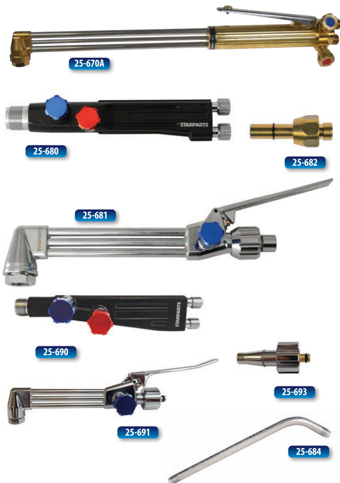
Gas Equipment (All prices in £ sterling ex.VAT)