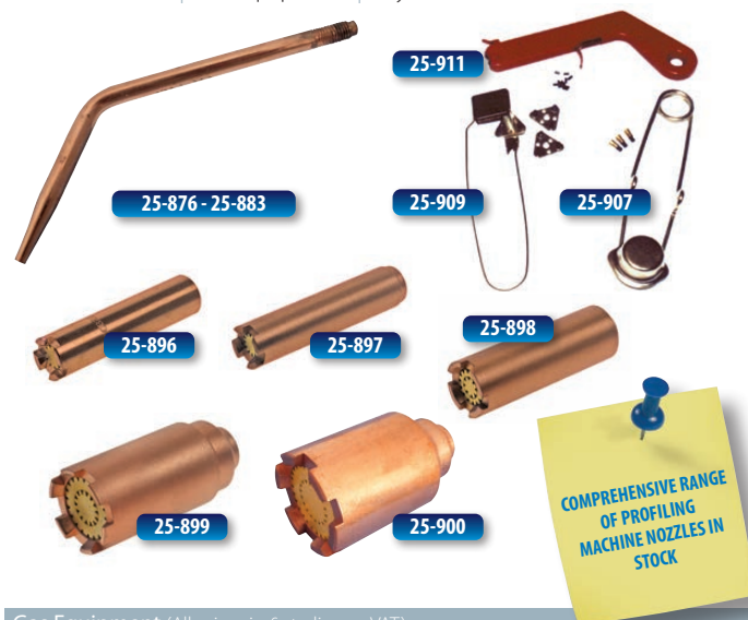
Gas Equipment (All prices in £ sterling ex.VAT)